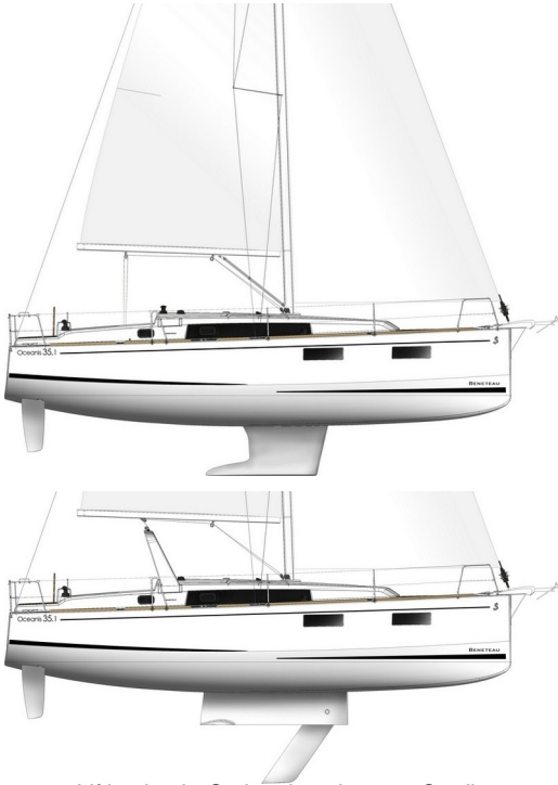
Lifting keel - Optional equipment: Cradle