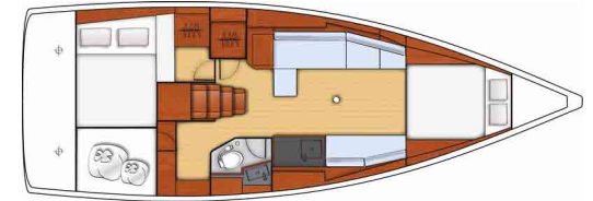
Week Ender - 2 convertible cabins