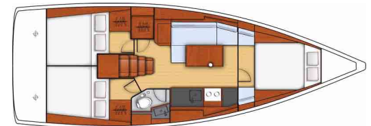
Cruiser - 3 cabins